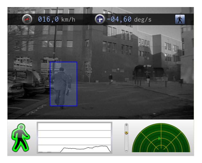
Figure 4: EDONA-LOVe interface for the safety of pedestrians

This use case validated our approach, showing its expressivity to quickly create custom components, and the possibility to quikly integrate these components into a full consistent system. External video streams were also integrated, showing its capacity to interface with an asynchronous environment.