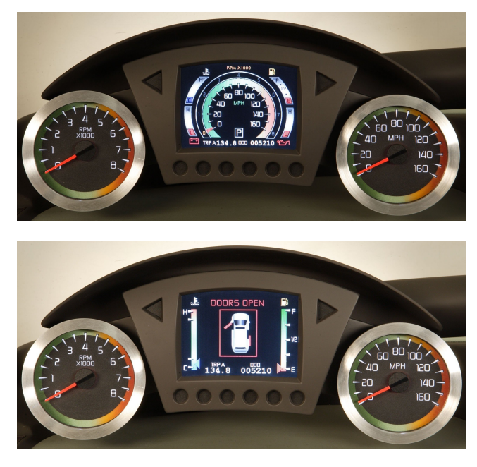
Figure 1: A hybrid – mechanical and screen-based – instrument cluster. Displays may be used to reproduce the traditional features of mechanical systems (here RPM and speed dials) – as demonstrated in the top figure – but may also be easily reconfigured to display other kinds of vehicule information.

raises several issues. Interoperability - the ability to easily exchange components specifications and designs - is a major industrial issue. Also, as they present information that may directly influence the driver behavior, these HMIs shall also be treated as safety-critical software components. We propose here a model-based approach that relies on a scene graph graphics layer and a synchronous functional layer. Synchronous languages [9, 13, 3] are standard representations for safety critical software, they enjoy a clear and simple semantics that allows various program analysis like automatic test generation [15] or model-checking [10]. An efficient design process and the ability to do some rapid prototyping are crucial as well. Our model comes together with dedicated tools for the assisted design and the compilation of components into executable graphics interfaces.