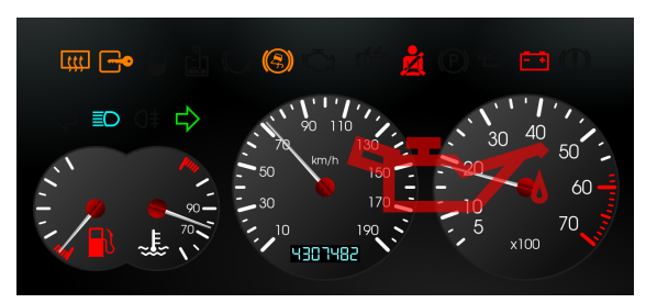
Figure 2: The car's instrument cluster model.

We tested the algorithm on a graphics interface representing the reconfigurable instrument cluster of a car: this includes lights, alert and warning indicators, odometer, speed, RPM, gas and temperature gauges. This model is a typical use case of safety-critical automotive user interface. This graphics interface is shown in figure 2. In this model, every indicator can be either "on" (coloured) or "off" (dark grey), furthermore, the red alert indicators can be scaled big and shown transparent over the speed/RPM gauges (as an emphasis for serious alerts). The odometer is made up of individual led bars (coloured of black) and any needle can rotate around its axis.